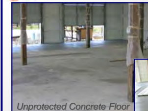
Unprotected Concrete Floor

Rust Bullet not only improves the appearance of concrete, it provides an impervious shield allowing easy clean up of oil, grease, and chemical spills along with strong protection against impact and abrasives.